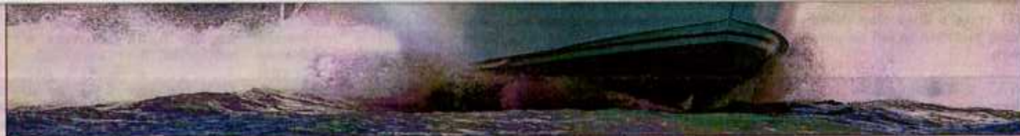
The O'Brien Kekoa 56 going through its paces off Townsville with Gold Coast skipper Luke Fallon at the helm.

The Kekoa's cockpit is all fishing. A Reelax